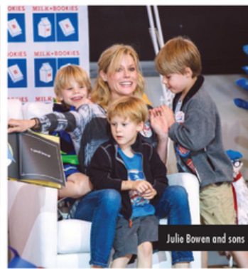
Julie Bowen and sons