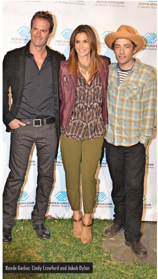
Rande Gerber, Cindy Crawford and Jakob Dylan