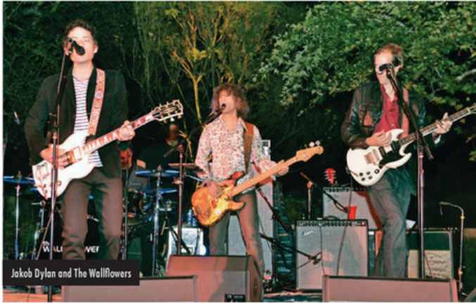
Jakob Dylan and The Wallflowers