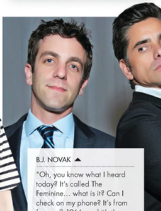
BJ NOVAK ▲

"Right now I listen to a lot of Phosphorescent."