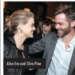
Alice Eve and Chris Pine