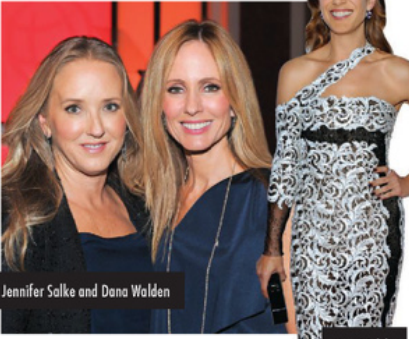
Jennifer Salke and Dana Walden

Who is your GO-TO DESIGNER for red-carpet events?